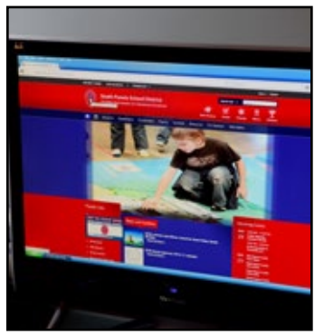
SPSD Online Page 14