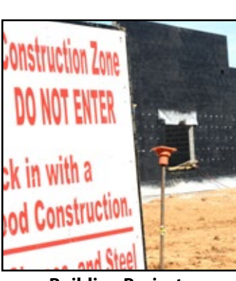
Building Projects Page 15