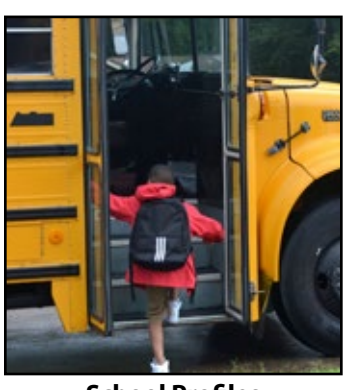
School Profiles Pages 5-11