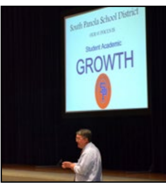
Superintendent's Welcome Page 4