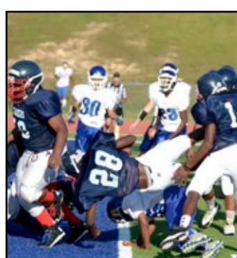
SPSD Athletics Page 12