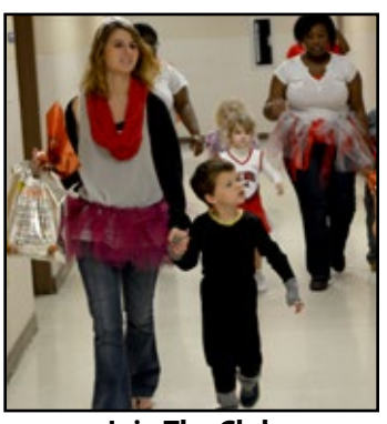
Join The Club Page 13